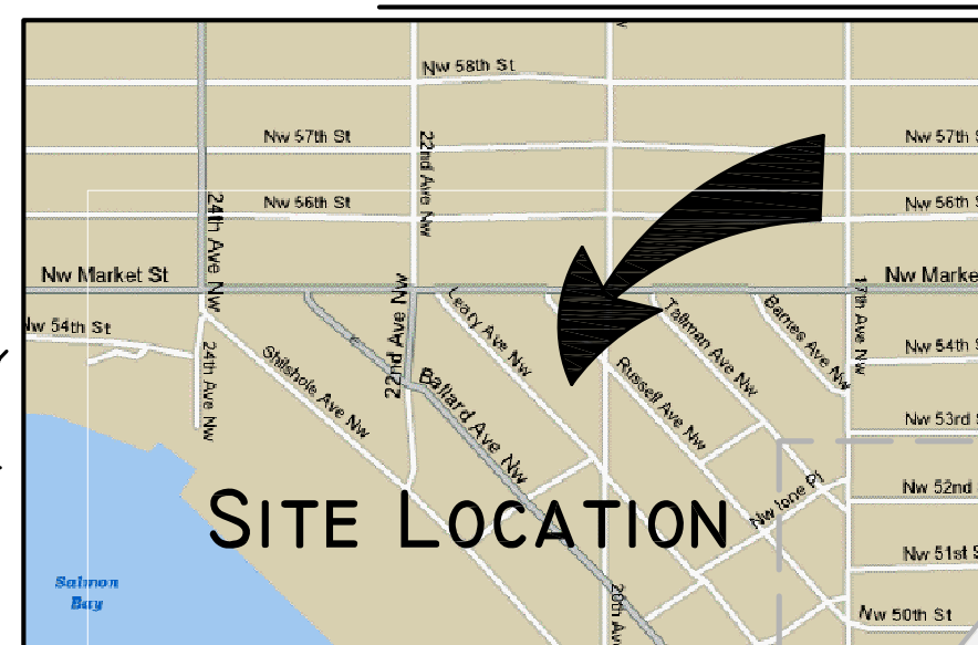
Vicinity Map Scale: 1"=200'